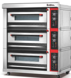
3 Deck Baking Oven (Gas / Electric)