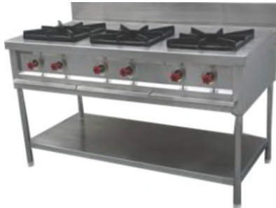
Three Burner Range Size: Customized