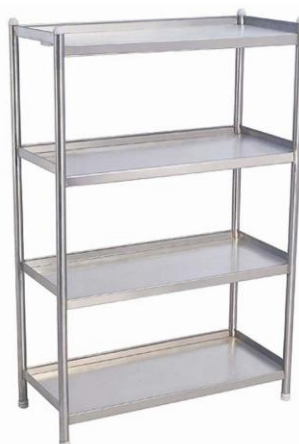
Storage / Clean Dish Rack Size : Customized