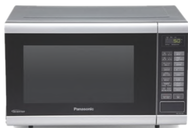
Microwave Oven Branded Cap. 15 to 30 ltr.