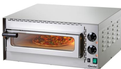
Pizza Oven Electric / Gas (Customised/Imported)