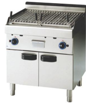
Lava Grill/Stone (Gas / Electric) SIZE: Customized/Important