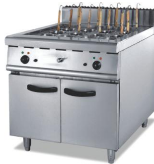
Pasta Cooker (Gas / Electric) Size : Customized