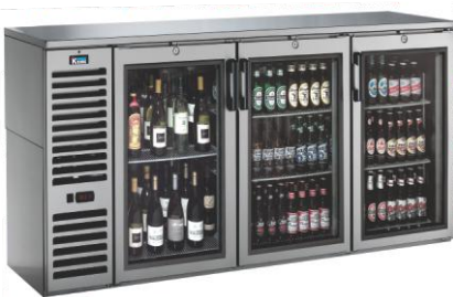
Three Door Back Bar Chiller Size : Standard (Imported)