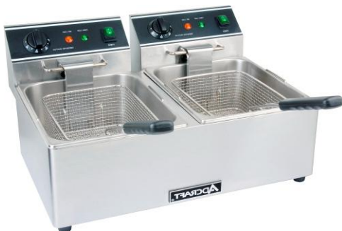
Deep Fat Fryer (Table Top) Single / Double Cap. 4 to 18 ltr.