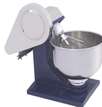
Dough Kneader (Electric) Cap. 5 to 100 ltr.