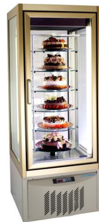
Vertical Display Counter Size : Customized