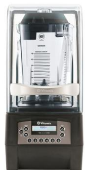
The Quiet Blander