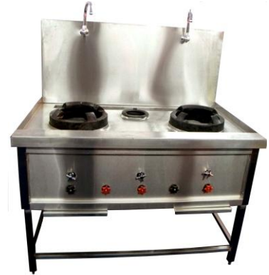
Three Burner Chinese Range Size: Customized