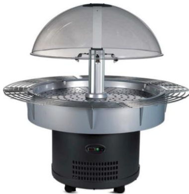
Salad Counter Size : Customized