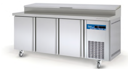
3 Door Under Counter (Pizza Makeline) Refrigerator / Freezer Size : Customized