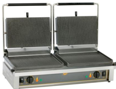
Sandwich Griller (Electric) Single / Double (STD/Jambo)