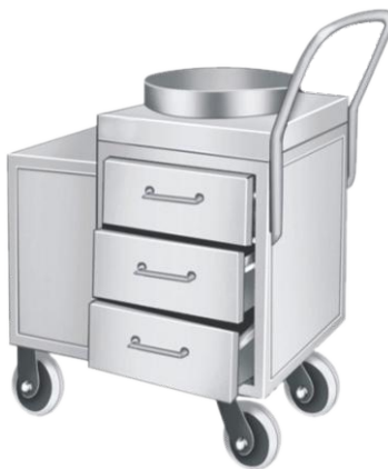
Tea Service Trolley Size : Customized