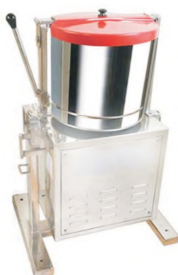
Tilting Wet Grinder (Electric) Cap. : 5 to 30 Ltr.