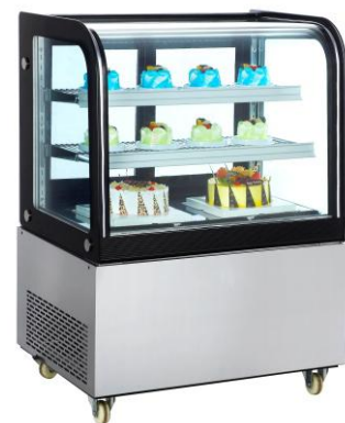
Bakery / Sweet Display Counter Size : Customized