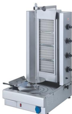
Shawarma Grill (Gas/Electric) Size: 2 To 4 Burner