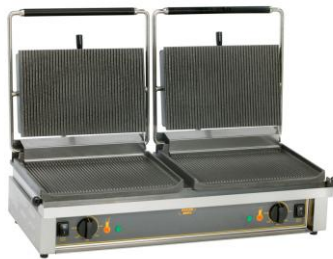
Sandwich Griller (Single/Double)