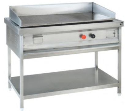
Dosa Plate Size: Customized