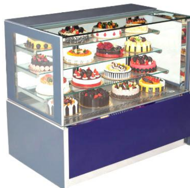
Bakery / Sweet Display Counter Size : Customized