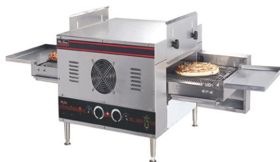
Conveyor Pizza Oven Electric / Gas Imported