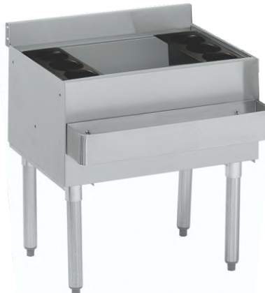
Cocktail Station with Speed Rail Size : Customized