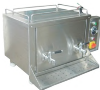
Tea Milk Dispenser (Size : Customised)