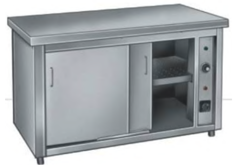
Hot Food Pick up Counter Size : Customized