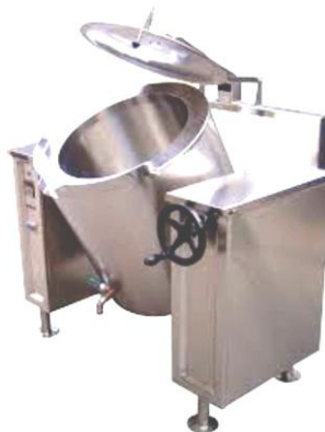
Bulk Cooker (Rice Boiler) Capacity : 50 To 250 Ltr.