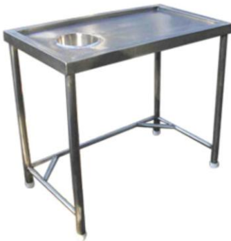
Dirty Dish Landing Table Size : Customized