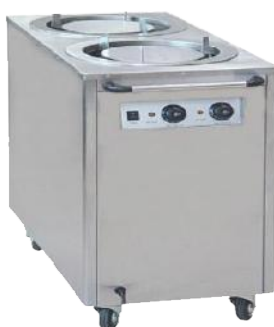
Plat Warmer (Electric) Single / Double Cap. 50 to 100 Plates