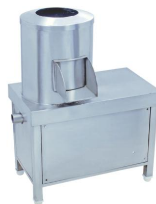
Potato Peeler (Electric) Cap. 5 to 50 kg.