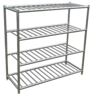
Pot Rack (Pipe Rack) Size : Customized