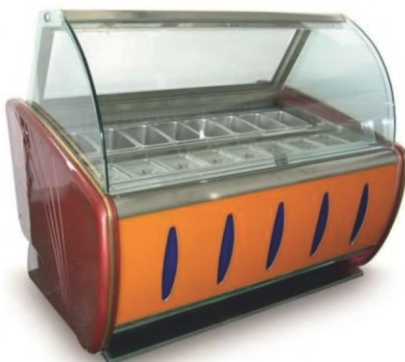
Ice Cream Parlor Size : Customized