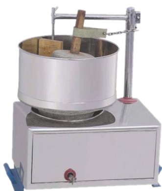
Wet Masala Grinder (Electric) Cap. 5 to 25 ltr.