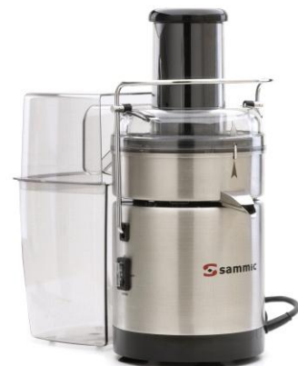
Licuadora Multi Juicer