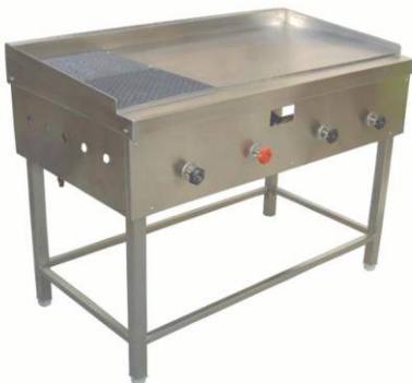
Chapati Plate With Puffer Size: Customized