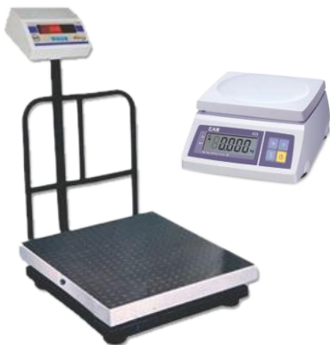
Weighing Scale Cap. 10 to 500 kg.