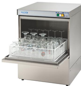
Glass Washer Cap. 30 to 40 Rack/h Size : Standard (Imported)