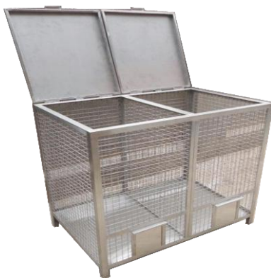
Onion / Potato Bin Size : Customized