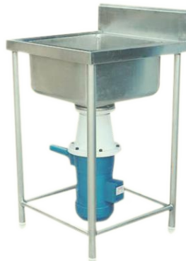
Garbage Crusher Cap. 1 to 5 HP