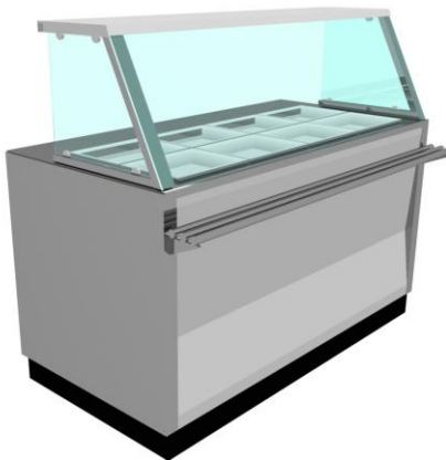
Bain Marie (Hot/Cold) Front Glass & Tray Slide Size : Customized