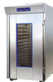
Proofing Chamber (Electric) Customized