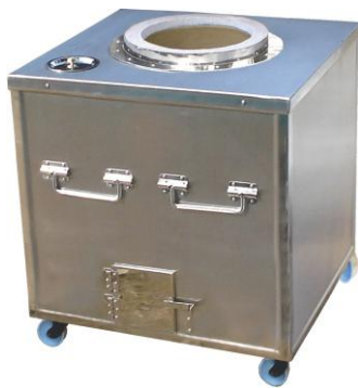
SS Mobile Tandoor (Gas / Charcoal) Size: Customized