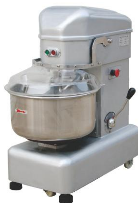
Spiral Mixer Cap. 5 to 80 ltr.