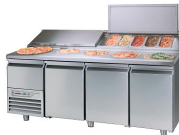
Under Counter (Pizza Makeline) Refrigerator / Freezer Size : Customized