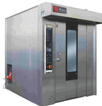
Rotary Oven (Gas / Electric)