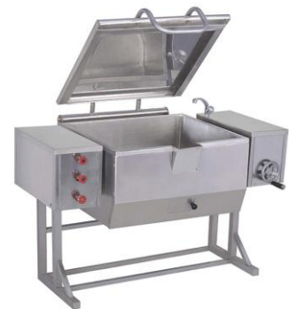
Tilting Brazing Pan Capacity : 50 To 200 Ltr.