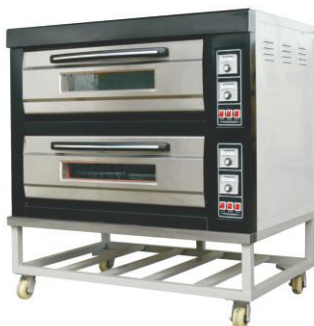
2 Deck Baking Oven (Gas / Electric)