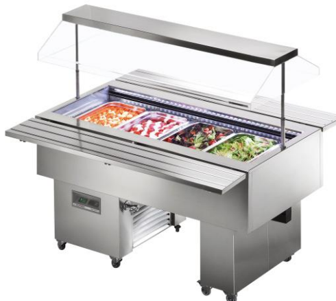
Salad Counter Size : Customized