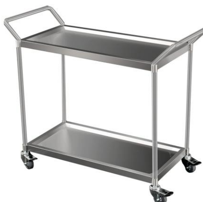
S.S Utility Trolley Size : Customized