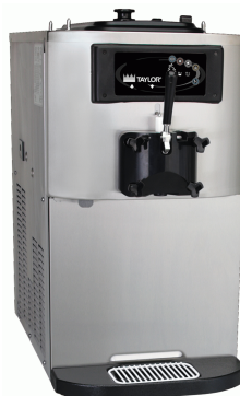
Model : 706