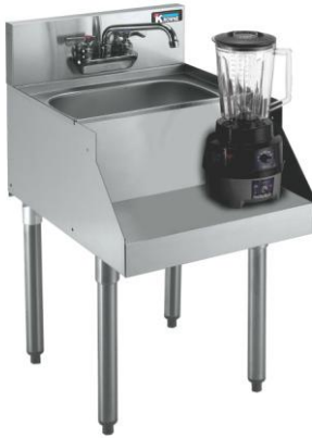
Blender Station with Sink & Tap Size : Customized