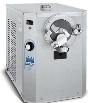
Model : 104