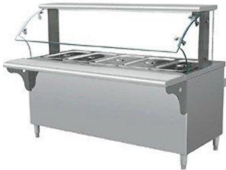
Hot Bain Marie with Sneeze Guard & Tray Slide Size : Customized