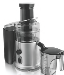
Juicer Mixer Standard/Imported