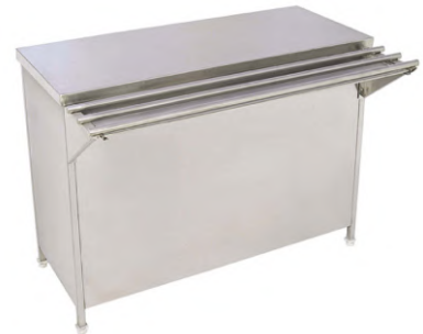
Cutlery Counter with Tray Slide Size : Customized