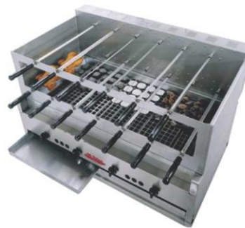
Charcoal Grill (Charcoal / Gas / Electric) Size: Customized