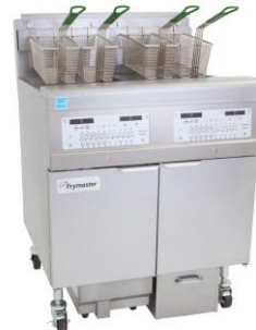
Deep Fat Fryer