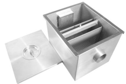
Grease Trap Customized