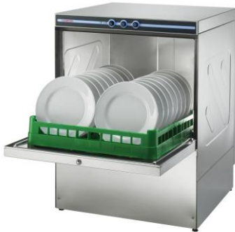
Under Counter Dishwasher Std/Imported