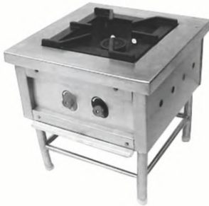
Single Burner Range Size: Customized