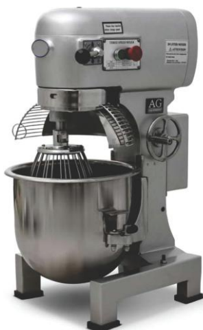
Planetary Mixer Cap. 5 to 80 ltr.