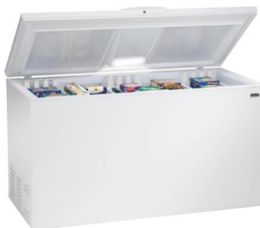
Chest Freezer (Deep Freezer) Cap. 100 to 1000 Ltr. (Branded)