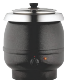
Soup Kettle Standard/Branded Cap. 7 to 15 ltr.