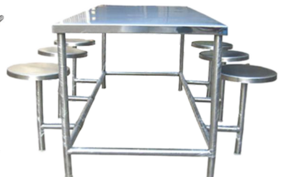
Dinning Table with Seater Size : Customized