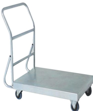
S.S. Platform Trolley Size : Customized