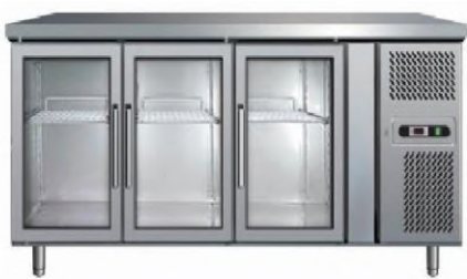
Glass Door Under Counter (Back Bar Chiller) Size : Customized