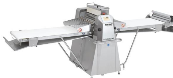
Dough Sheeter (Electric) Table / Floor Model