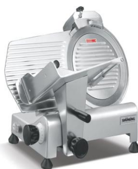
Meat Slicer (Electric) Slice : 150 to 300 mm