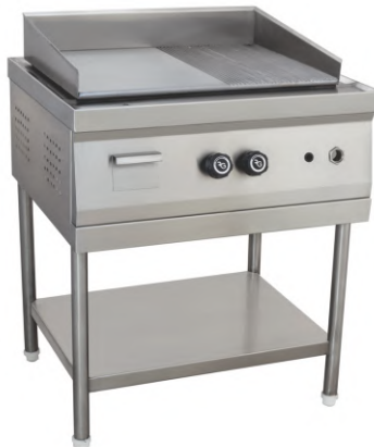
County Grill (griddle Plate) Size: Customized