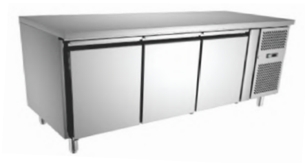
3 Door Under Counter Refrigerator / Freezer Size : Customized