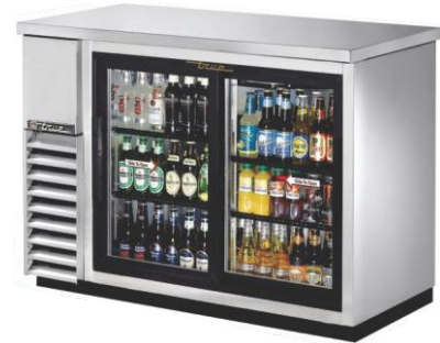
Two Door Back Bar Chiller Size : Customized (Imported)