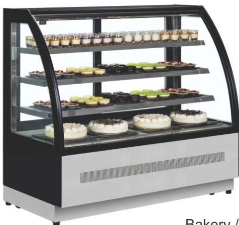
Bakery / Sweet Display Counter Size : Customized