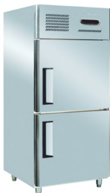
Vertical Two Door (Refrigerator / Freezer) Cap. 400 to 600 Ltr.