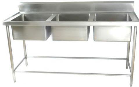
3 Sink Dish Wash Unit Size : Customized