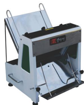
Bread Slicer (Electric) Table / Floor Model

CHANMAG / BERJAYA based on professional know - how with R & D manufacturer technique and satisfactory service attitude, to offer excellent bakery equipment, to contribute the bakery customers. Innovate to develop new product, enhance production technique improve product quality for providing more satisfactory product customers. Keep sincere & honest; identify right & wrong, harmonious to concern each other, to unit together, to develop benefit for share with customers' subcontractor, colleague, stockholder and publics in the country.