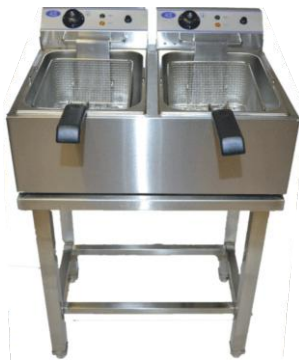
Deep Fat Fryer (Gas / Electric) Cap.: 8 to 20 Ltr.