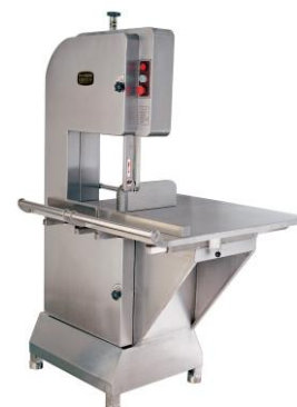
Bone Saws (Electric) Blade : 16/20 mm