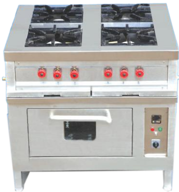
4 Burner Range With Oven Size: Customized