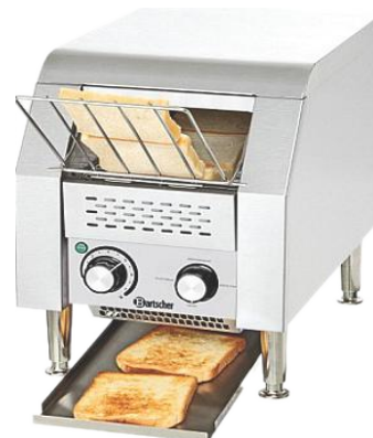
Conveyor Toaster (Electrical) (150 / 300 Slice)