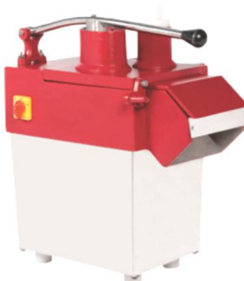
Vegetable Machine (Electric) Cap. 40 to 200 kg./hr.