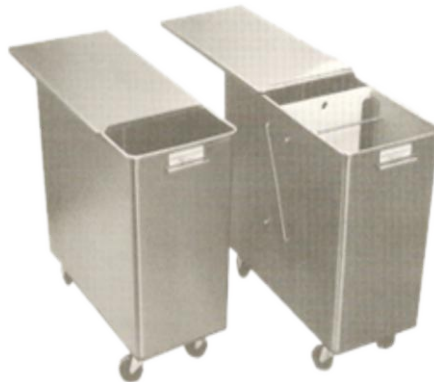
Ingredient Bin (Atta Bin) Size : Customized