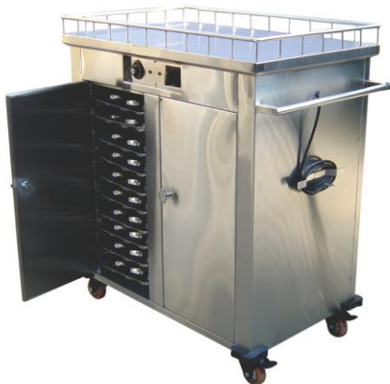
Hot Food Service Trolley Size : Customized