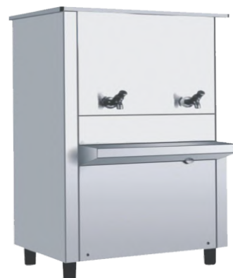
Water Cooler Cap. 25 to 1000 ltr.