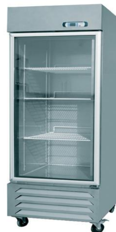
Visi Cooler Capacity : 300 to 500 ltr. (Branded)