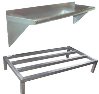
Wall Shelf / Dunnage Rack Size : Customized