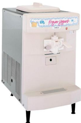
Model : 142