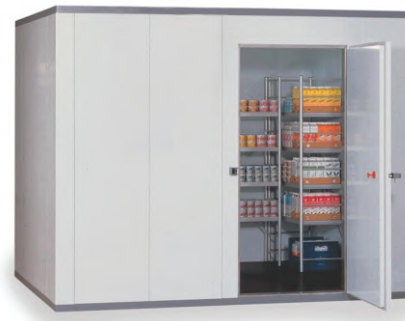
Walk in Chiller / Walk in Freezer Size : Customized