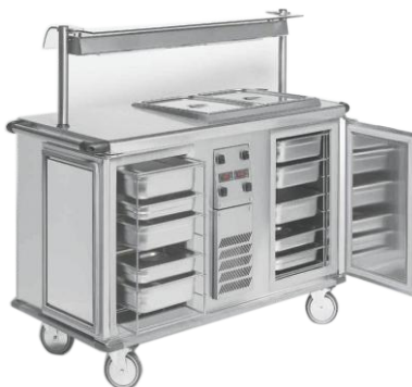
Hot Food Service Trolley Size : Customized