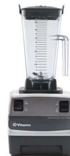
2 Speed Blander