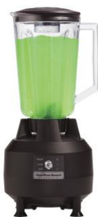
2 Speed Blander