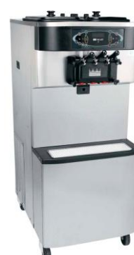
Model : C712 / 713