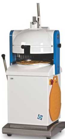
Dough Divider / Rounder (Electric)