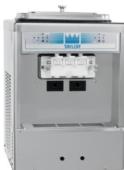
Model : 161