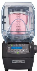
Commercial Summit Blander