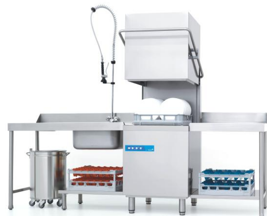
Hood Type Dishwasher Cap. 60 Rack/hour

Dishwasher range is ideal for high volume catering & hospitality dishwashing perfect for the busy commercial kitchenware washing area