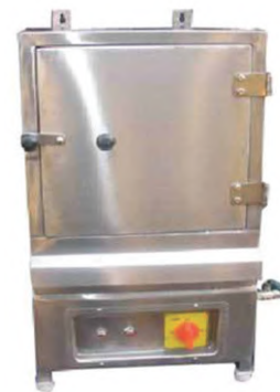
Idli Steamer (Gas / Electric) Cap. : 36 to 250 Itli