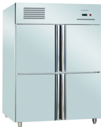
Vertical Four Door (Refrigerator / Freezer) Cap. 800 to 1200 Ltr.