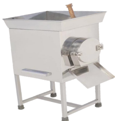
Pulverizer (Electric) Cap. 2 / 3 / 5 HP.