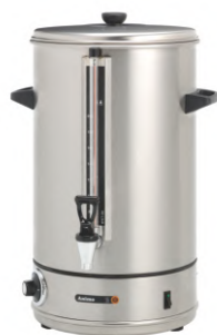
Water / Milk Boiler (Customised/Imported) Cap. 10 to 40 ltr.