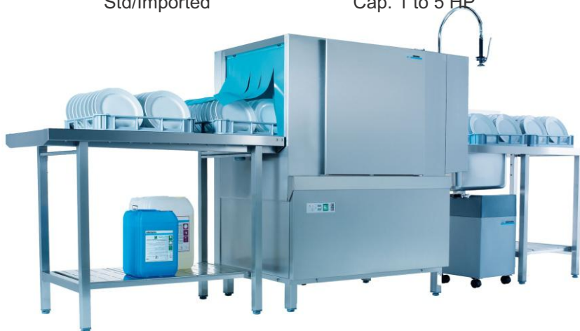
Rack Conveyor Dish Washer Cap. 155 Rack/hour