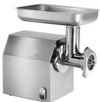
Meat Mincer (Electric) Cap. 20 to 150 kg. / hr.