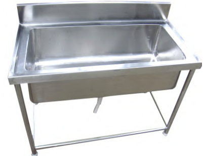
Pot Wash Unit Size : Customized